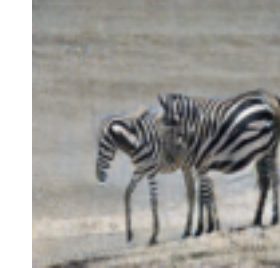
Q_{12}(w, f) \rightarrow P_{0.5}(w, f)