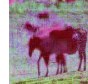
P_{0.5}(w) \rightarrow Q_8(w, f)