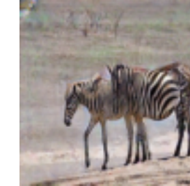
P_{0.5}(w, f) \rightarrow Q_{12}(w, f)